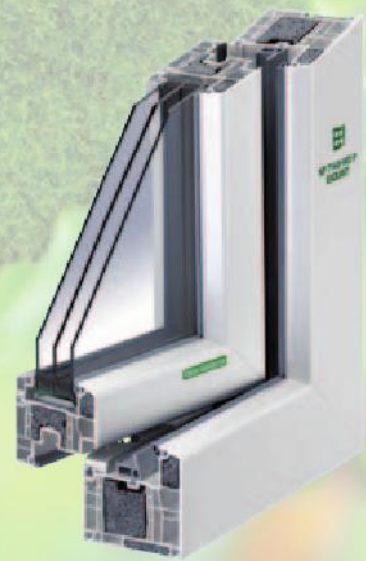
KF 714 S-WD P