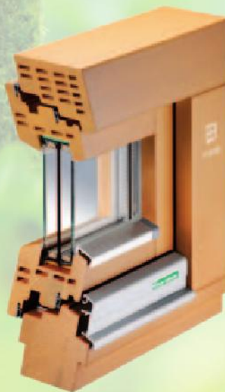
HF 90 WD