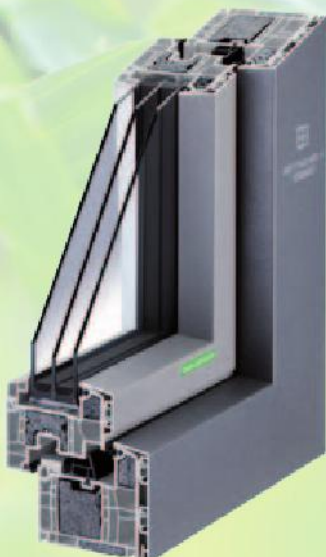
AKF 714 S-WD P